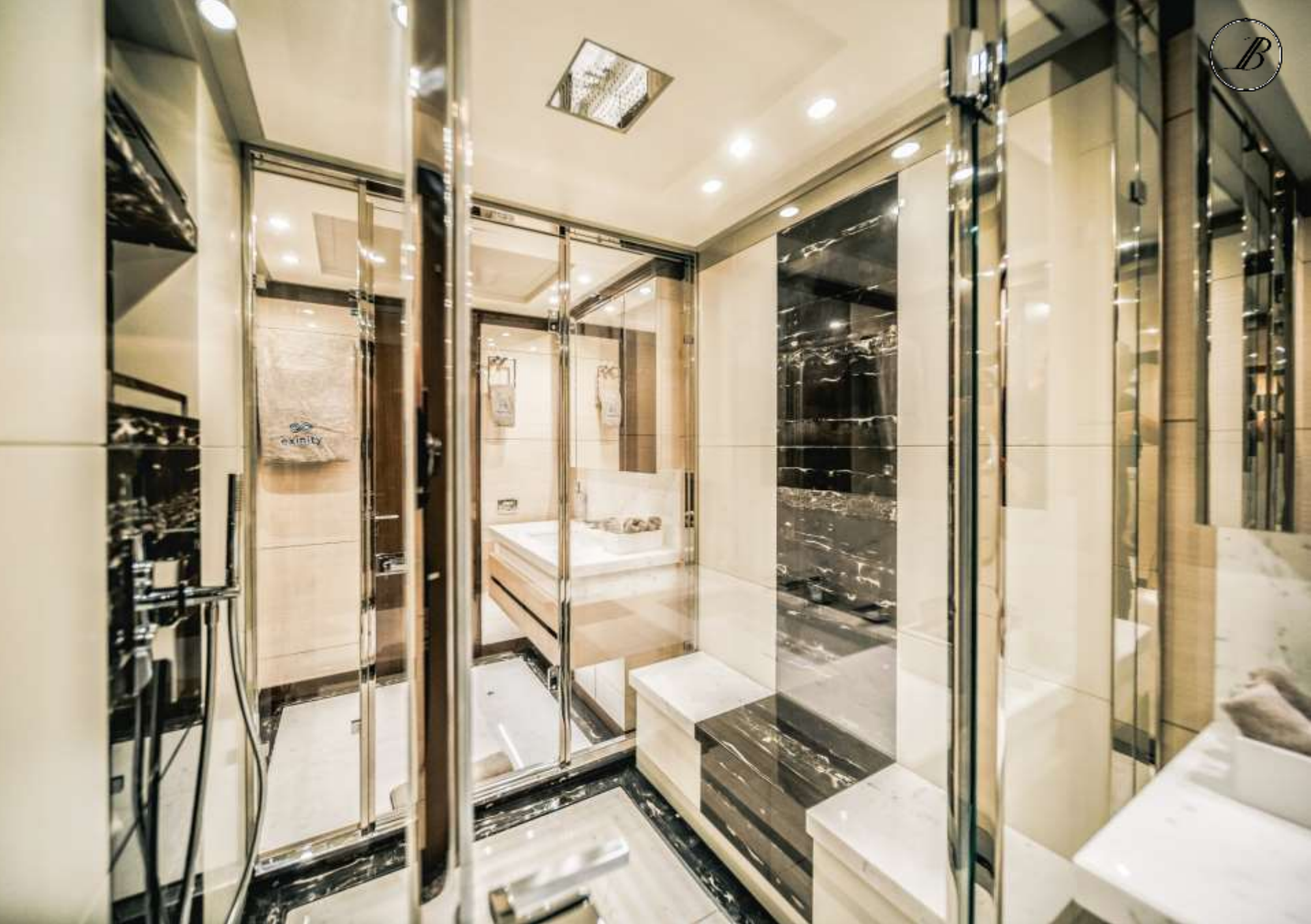
Master Cabin Head