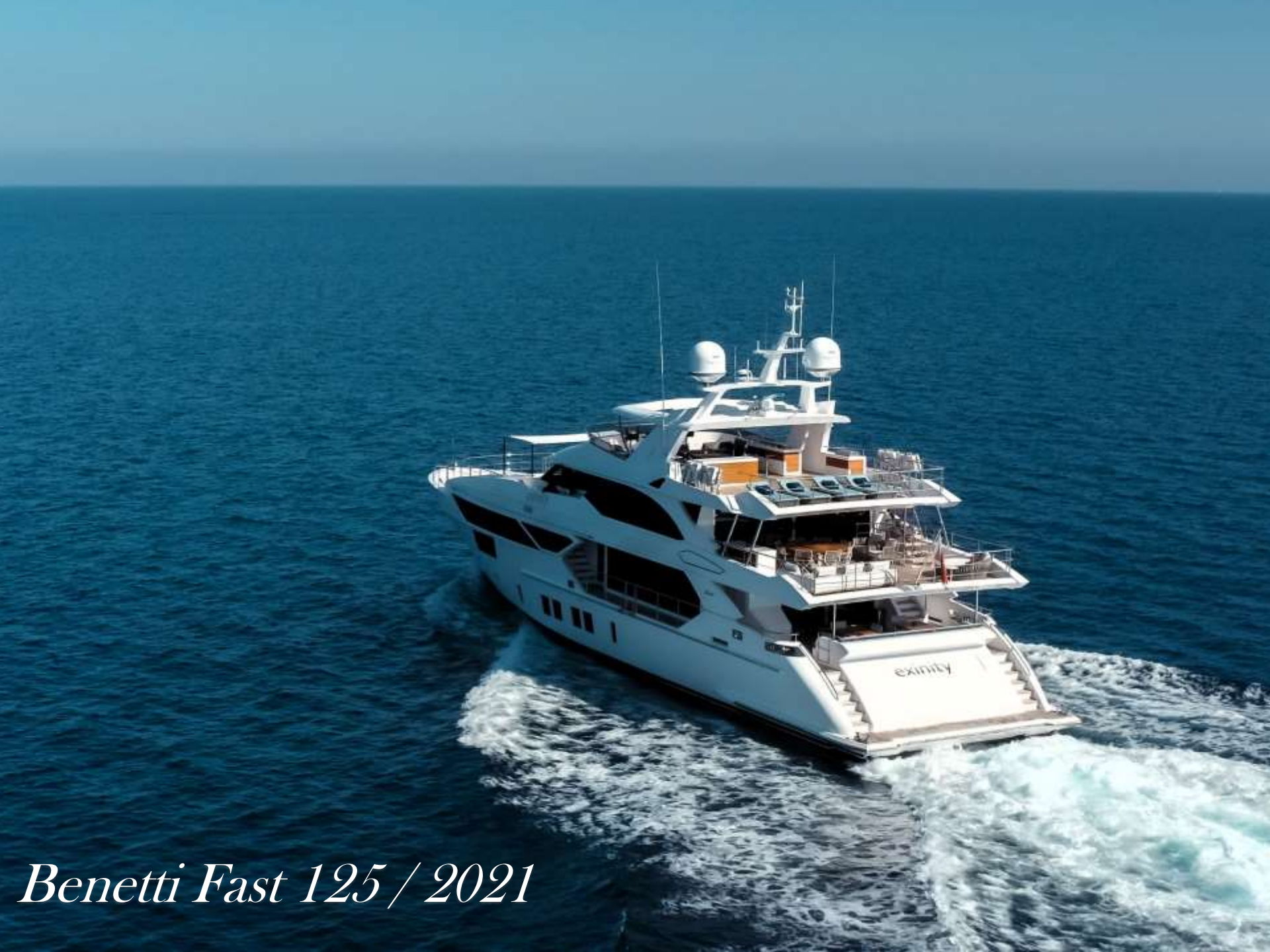
Benetti Fast 125 / 2021