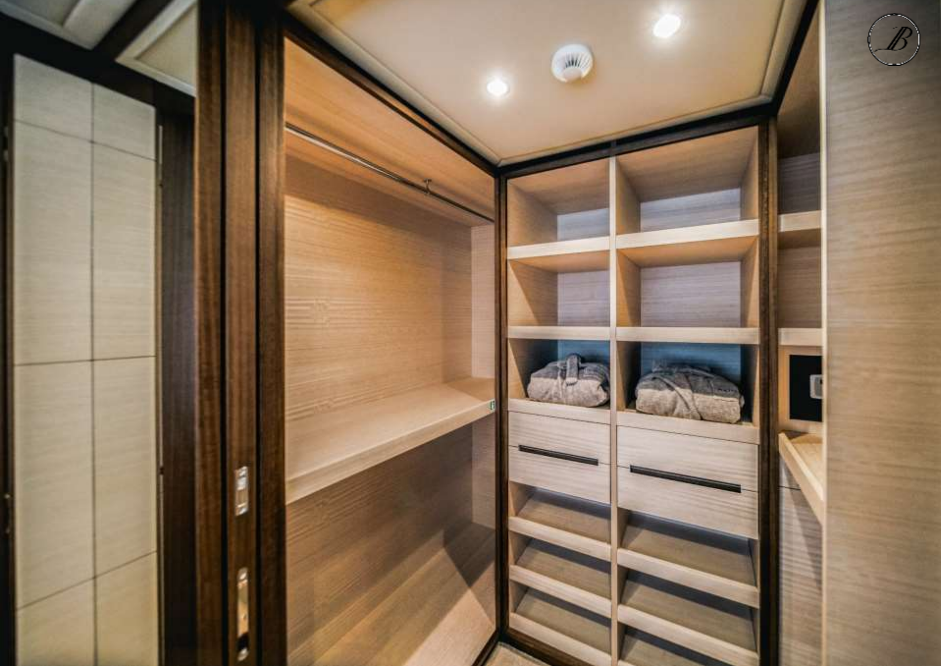
Master Cabin - Walking Closet