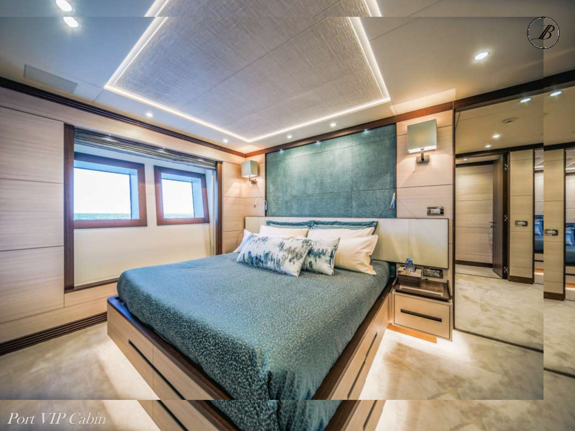
Port VIP Cabin