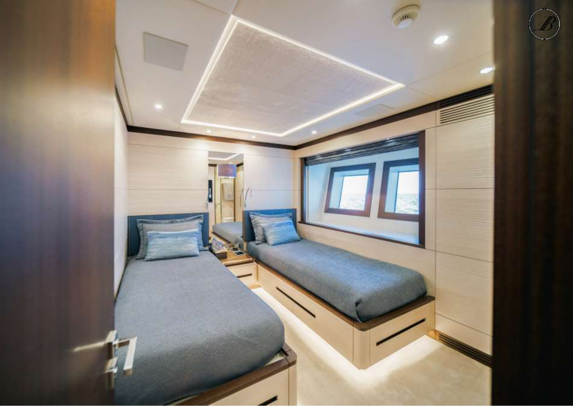
Port Guest Cabin