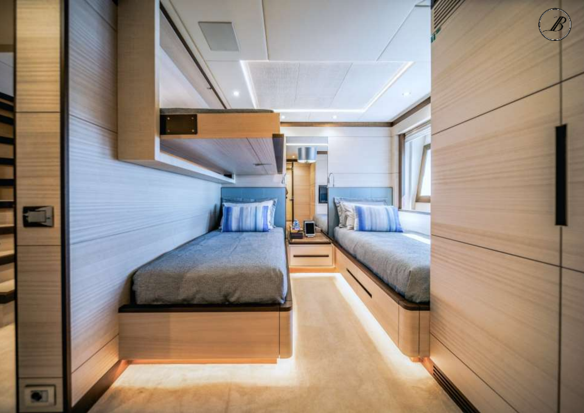
Strb Guest Cabin