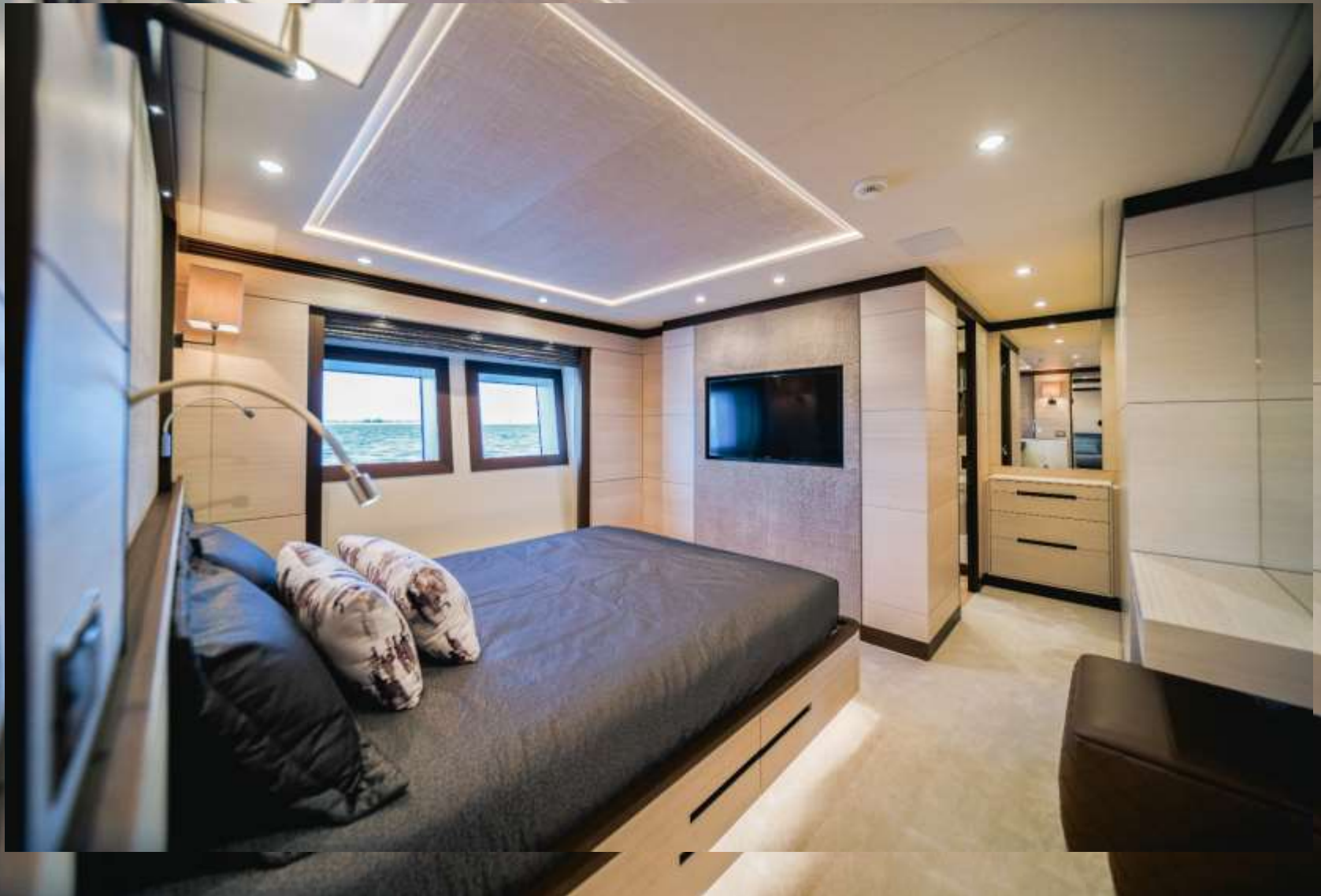
Strb VIP Cabin