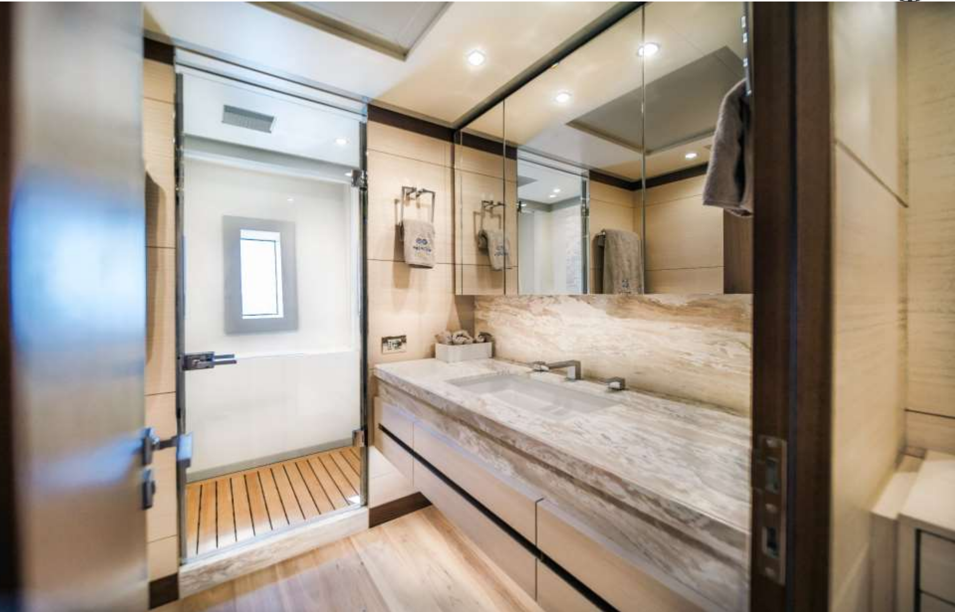
VIP's & Guests Heads